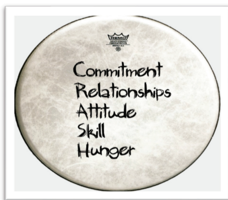
The CRASH! Elements

CRASH! is an easy-to-remember acronym that stands for: